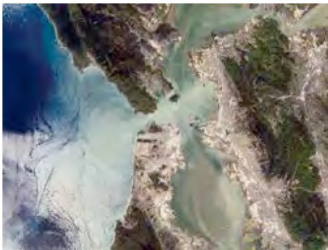
Figure 7.1: San Francisco Bay plume from space. NASA. http://www.nasa.gov/mission_pages/station/main/iss004e10288_feature_prt.htm .

To highlight the influence of pollutants on the study region, the San Francisco Bay Estuary alone carries a pollution load generated by approximately eight million people living in the San Francisco Bay Area as well as effluent from the agricultural Central Valley, via the Sacramento and San Joaquin rivers. Contaminants – including agricultural and livestock waste, wastewater, sewage outfalls, historic mining and industrial wastes – can be carried into the study region via the freshwater outflow from San Francisco Bay (i.e., the San Francisco Bay plume; Fig. 7.1). The plume extends as far as the Farallon Islands and Cordell Bank after heavy rainfall ( unpublished data ); and carries nutrients during spring and summer that stimulate phytoplankton growth within the study region.