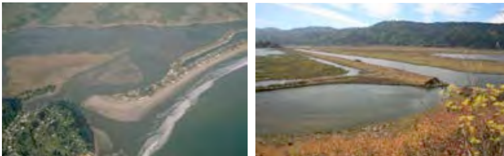
Figure 6.10 Left: Bolinas Lagoon, CA. Right: Tomales Bay, CA.

The physical structure of estuarine habitat is likely to undergo significant changes in the face of changing climates. Sea level rise is among the most important climate change factors forcing changes in the physical structure of estuarine systems in the coming decades. Other factors such as increasing air and sea surface temperatures and CO 2 may interact with sea level rise to influence the physical environment of these habitats. Climate change is also projected to result in changes in oceanographic and atmospheric linkages resulting in changes in ocean currents and storm cycles that will likely influence estuarine geomorphology. Finally, the hydrological cycle, including rainfall and outflow from rivers into estuaries will also influence the transport and deposition of sediments with long-term consequences for the physical structure of California estuaries.