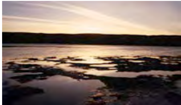
Figure 6.11 Mudflats in Tomales Bay, CA. Dan Howard.

Mudflats : Estuarine mud flats, in contrast to other intertidal soft sediment habitats such as sandy beaches, cannot develop in the presence of wave action and need a source of fine grain sediments (Lenihan and Micheli 2001). Mud flats are located in partially protected bays, lagoons and harbors. Examples within the study region include: Pillar Point Harbor, Bolinas Lagoon, Esteros Americano and de San Antonio, Tomales Bay (Fig. 6.11) and Bodega Bay. Mud flats will be threatened by sea level rise, ocean acidification, organic