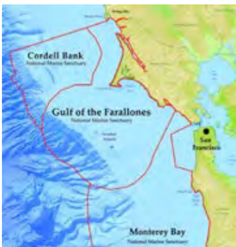
Figure 1A: Cordell Bank, Gulf of the Farallones and northern jurisdictional area of Monterey Bay National Marine Sanctuaries. T. Reed (2008).

The National Marine Sanctuary System consists of 14 marine protected areas that encompass more than 150,000 square miles of marine and Great Lakes waters from Washington State to the Florida Keys, and from Lake Huron to American Samoa. The system includes 13 national marine sanctuaries and the Papahānaumokuākea Marine National Monument (ONMS 2006). The study