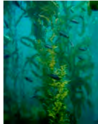
Figure 6.9. Kelp forest community.

Upwelling: The direction of change in upwelling for the study region is uncertain, but either scenario (increases or decreases in intensity) will affect nutrient delivery to the nearshore subtidal. Increased nutrient availability in the nearshore may therefore benefit benthic macroalgae as well as phytoplankton. However, intensification of upwelling could also alter the strength of offshore transport, increasing the dispersion of larvae and spores released in the nearshore subtidal, as well as enhance turbulent mixing, thus disturbing food particle concentrations critical to larval survival (Bakun 1990; see 4.4 Population Connectivity).