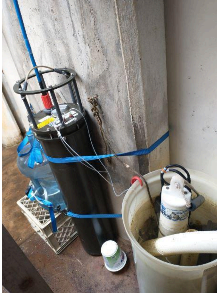
Figure 1. IFCB-163 is located in the seawater pump house at the UC Davis Bodega Marine Laboratory. The instrument is co-located with a CTD and Fluorometer and draws up water from the