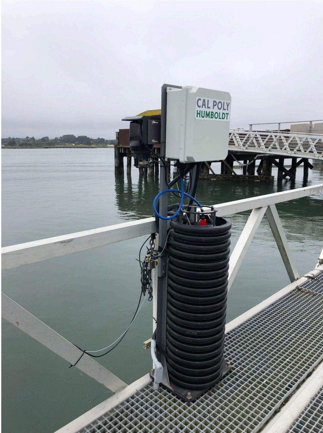
Figure 1. IFCB-162 is located at the Hog Island Oyster Company in Humboldt.