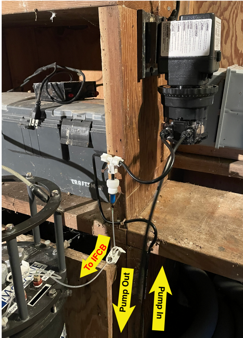
Figure 2. Water is drawn up from the surface through a peristaltic pump. IFCB samples are drawn from a tee fitting set inline with the pump intake.