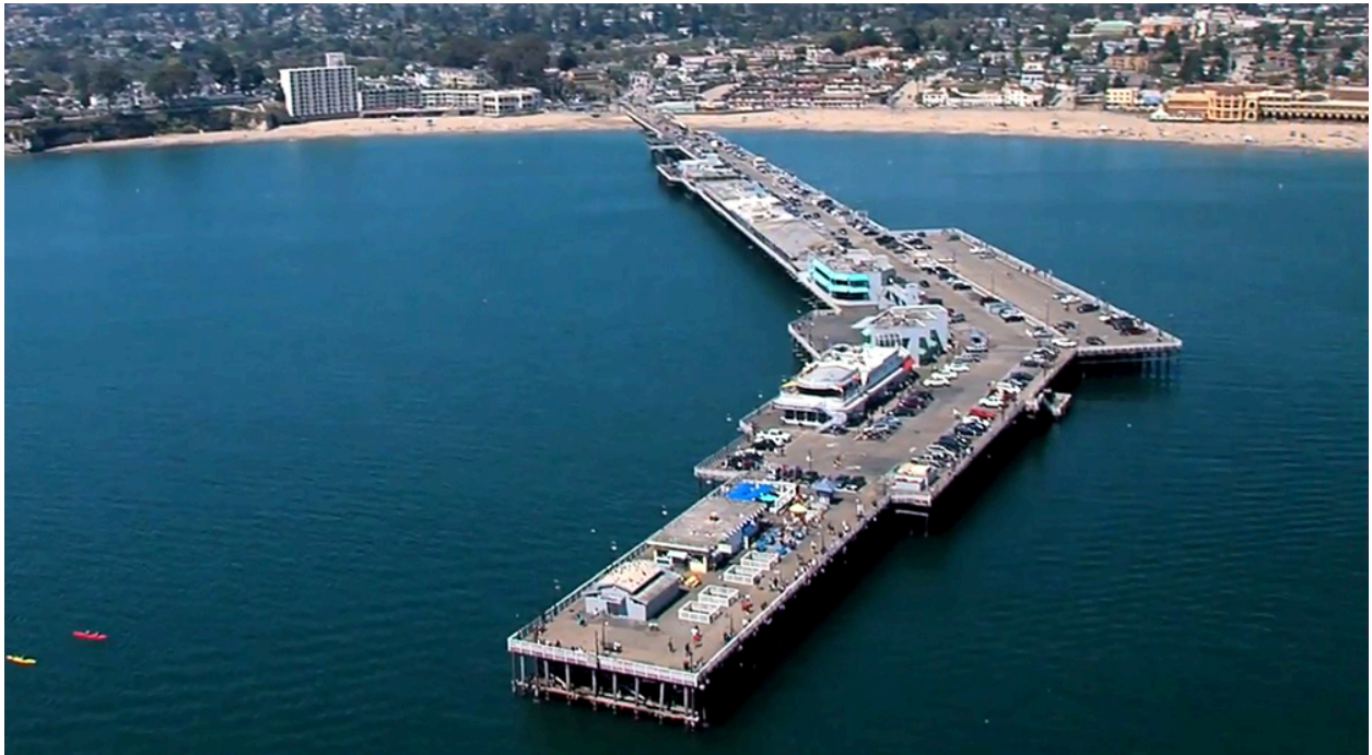
Santa Cruz Wharf